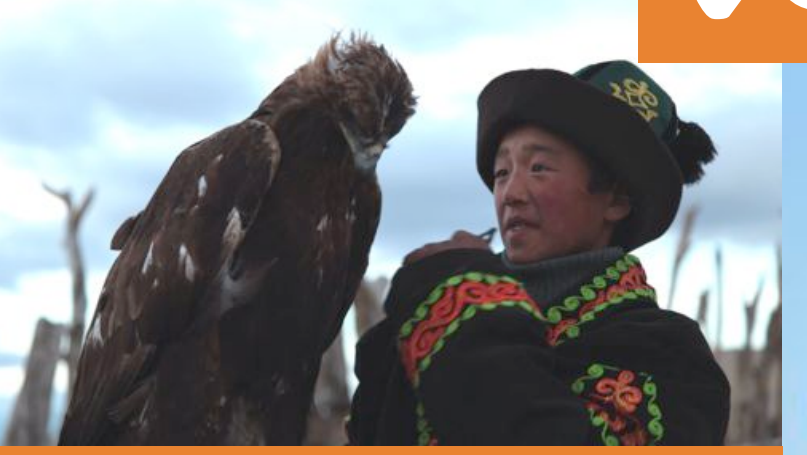
Directed by Gilles de Maistre