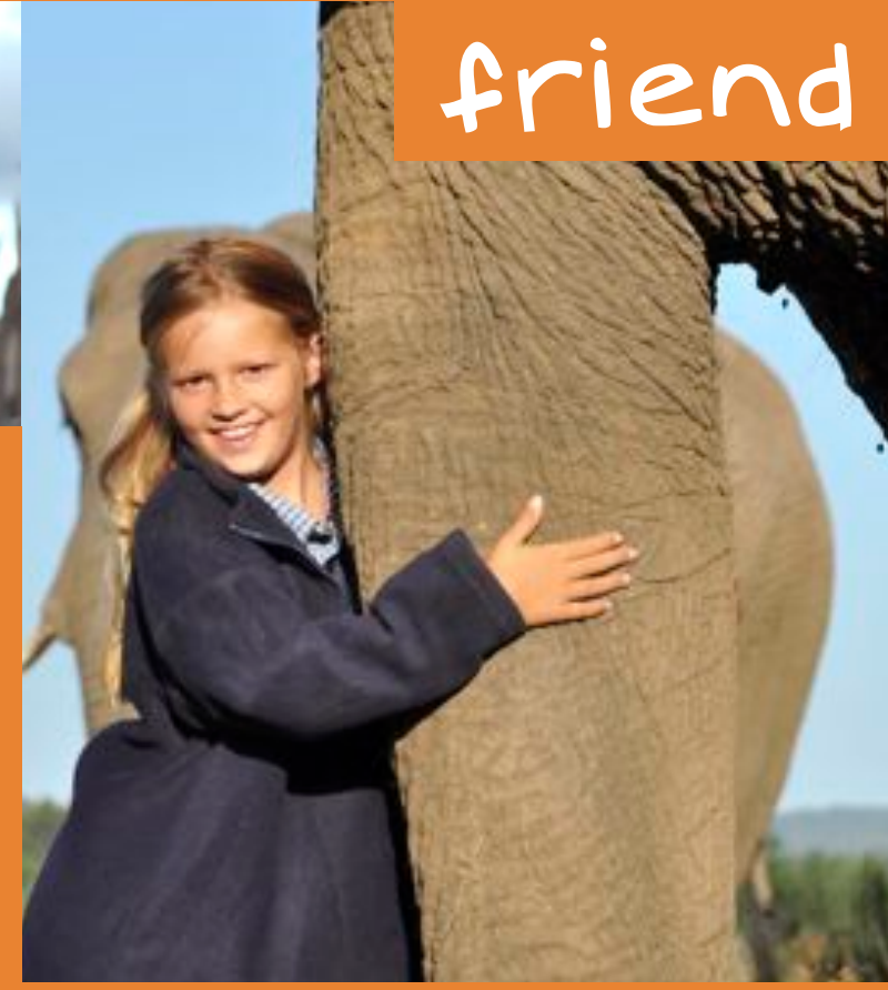
4 x 52 minutes