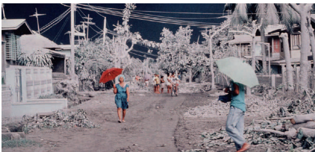
Pinatubo Volcano Eruption